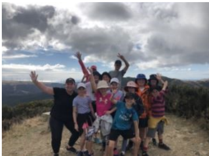
Here we are at the top of Johnston Hill