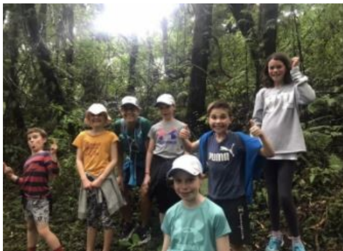
Some of us in Burrows Reserve